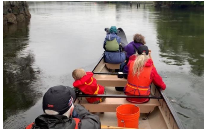
Restart the Gorge - VCKC paddlers of all ages tour the Gorge in VCKC's 29' Langley - Shawnigan