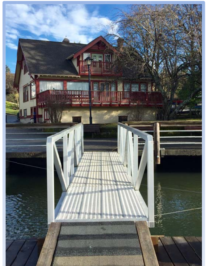
High tide: Notice the angle of the ramp!!