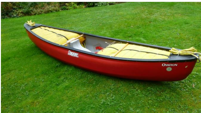
Dagger Ovation Royalex Canoe for Sale