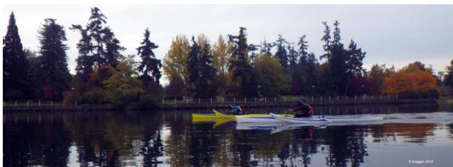
Sunday paddlers on the Gorge