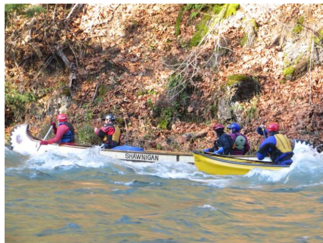
Remembrance Day on the Cowichan 2014

Paddle for the Kids 2016 will be on Saturday March 19 th . PFTK will start around February 7 th with a paddle to Spinnakers.