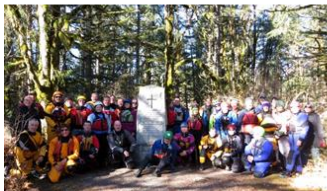
Remembrance Day on the Cowichan 2014