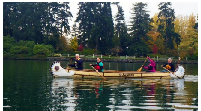
Sunday paddlers on the Gorge