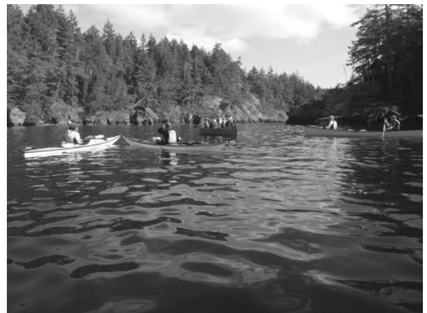
VCKC paddlers at the entrance to Roche Cove.

We set out to go to Whiffen Spit and the Strait of Juan de Fuca, but the flood current caused some problems for those sterns unused to steering in current. After thirty minutes and four passing powerboats having to thread their way through a scattered fleet of ten boats, we took the hint and turned about and paddled with the current into Sooke Basin. We followed the south shore of the Basin and the newer sterns regained their skills. By the time we reached Anderson