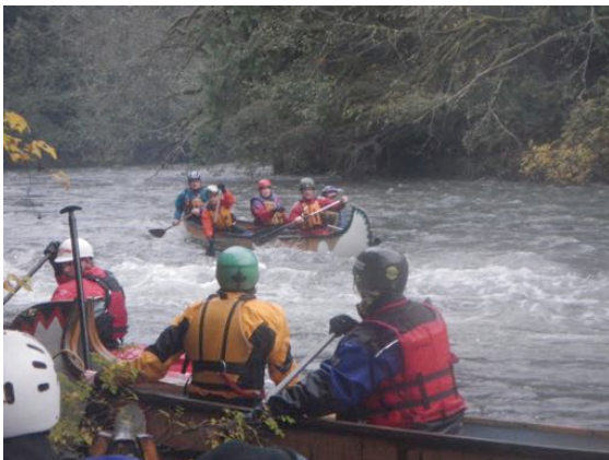
Voyageur paddlers running rapids on the Cowichan River

Tandem and solo canoes are welcome, of course. Please let Joe or Dan know if you plan to take part. Non-Voyageur paddlers must have passed a Moving Water course and be properly equipped - canoe with airbags, bailers, painters, throwbag, as well as helmet, wet or dry suit and PFD.