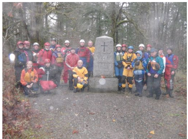
VCKC members at the Burma Star Memorial in Cowichan River Provincial Park