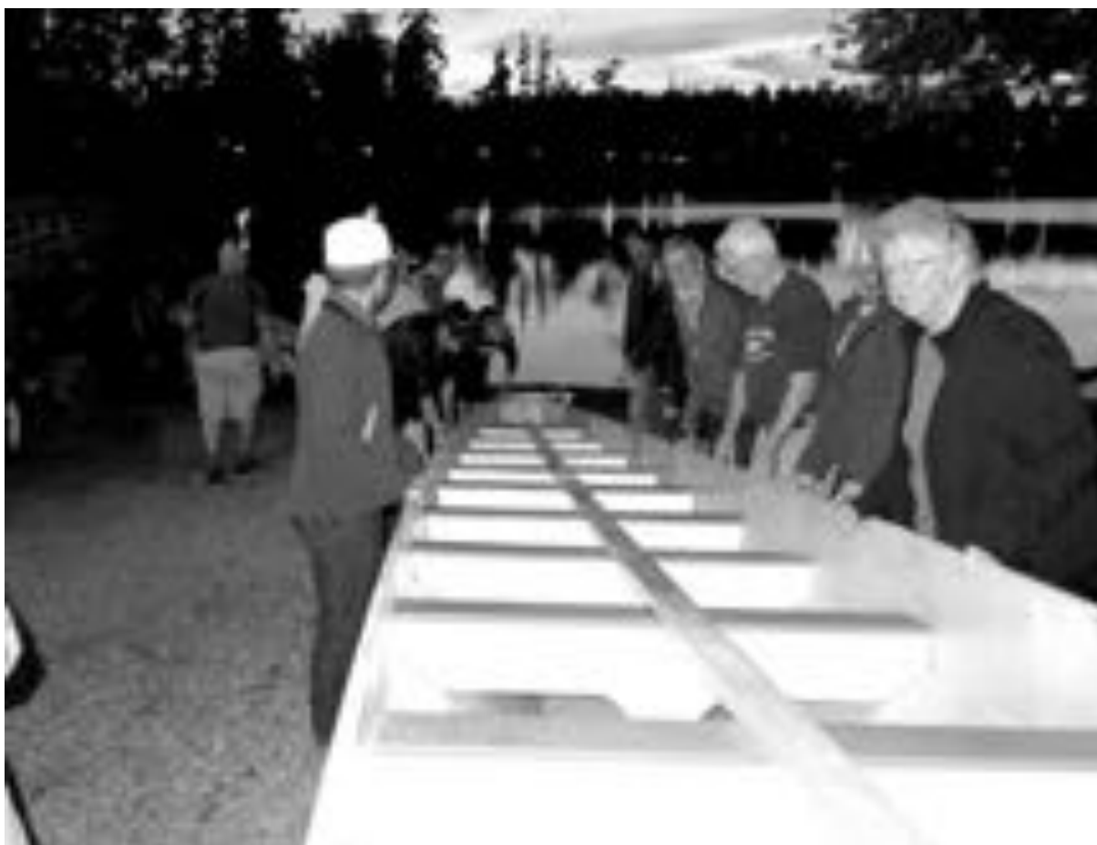
VCKC members lend a hand - late at night - to move the VCKC dragonboat.