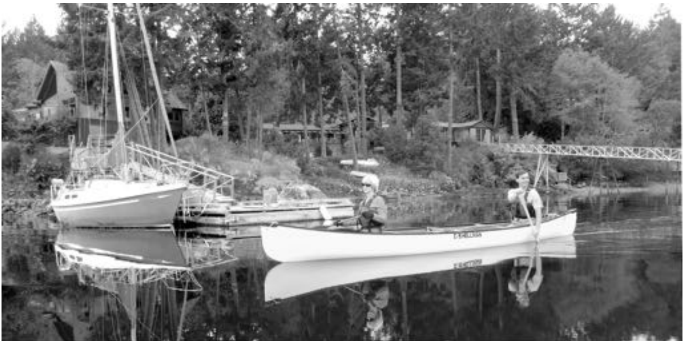
VCKC paddlers on October's flatwater trip.