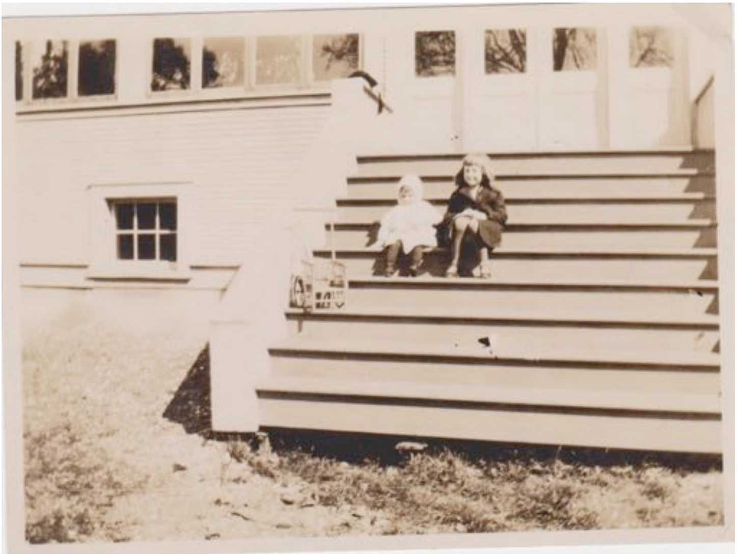
Do you recognize the building? An older photo of what is now a very popular community location.

Linda and Alan Thomson will lead a flatwater trip on Saturday, November 22 nd . Please watch your e-mail for further details.