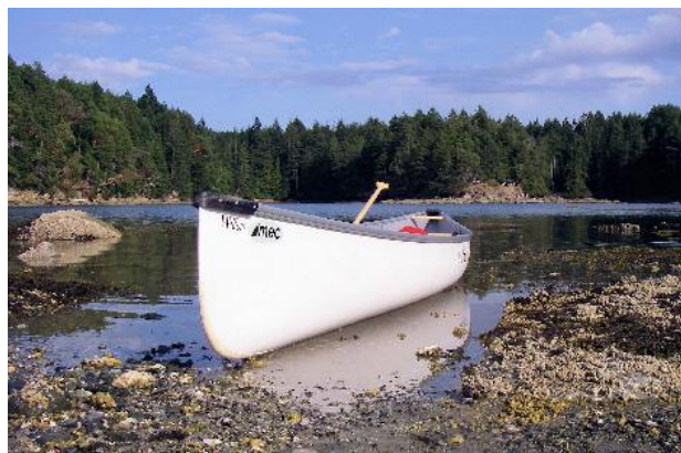
Gabriola Island