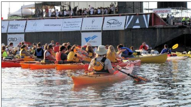
Symphony Splash - August 2009

Please contact Dorothea at kayakcourses@vckc.ca